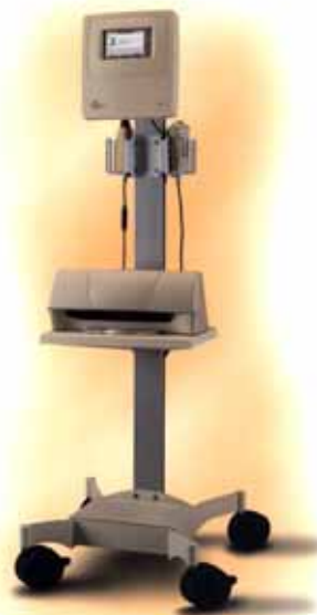
Figure 1. Heartwave Apparatus

The spectral analysis method, developed by the group of researchers led by Richard J. Cohen, from M.I.T., Cambridge, USA is used in clinical practice. This group has introduced the technique for the standard evaluation of MTWA through the exercise stress testing. The apparatus is commercialized under the name HEARTWAVE and is property of CAMBRIDGE HEART. In our country, PHILIPS holds the distribution rights for the apparatus. (Fig.1)